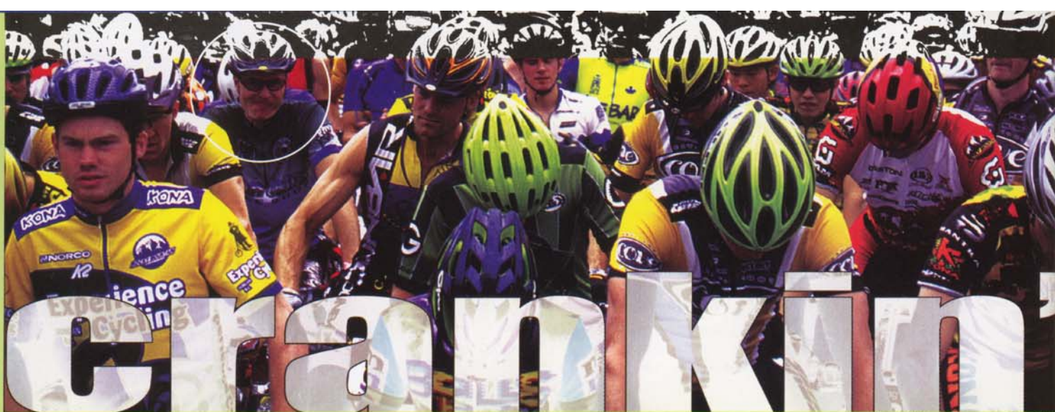
Brian Goldstone photo courtesy Test of Metal